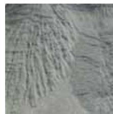
Sand Zand Sand Arena