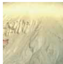
Salt Zout Salz Sal