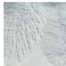
White sand Wit zand Sand Arena blanca